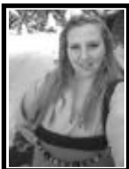
Archery Helga of Ramshaven