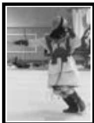
Rapier Alienor la fileuse