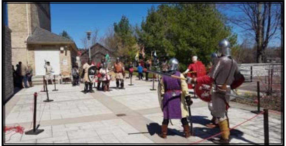
"A place to gather and mingle with the mundane world"