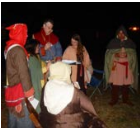
Singing by the campfire outside our cabin was also great fun.