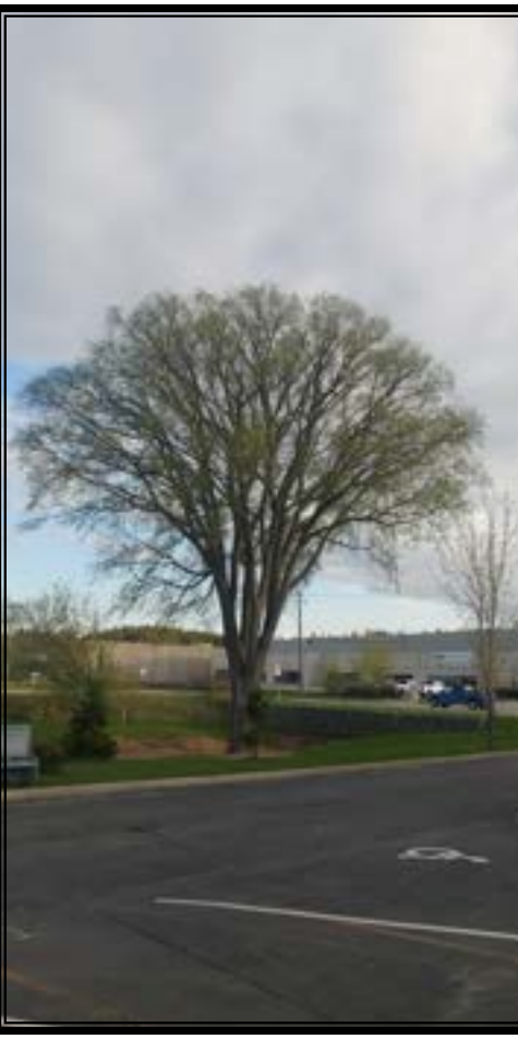
"a good place for trilliums to grow"