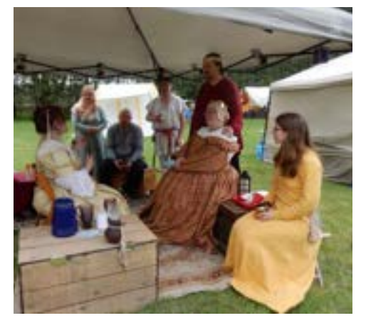
Their Excellencies Ramshaven held an informative and social Officers meeting while at FOOL. News in advancements for the Barony to come. Volunteers needed.