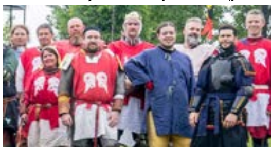
Photo was swiped from the gathering pages and cropped for the purpose of this paper...

We needed a little help and recruited some folks to assist with the many battles fought at Murder Melee this summer, however, with the assistance, we were grateful to have managed a win and several well fought battles. Go Ramshaven!