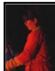
Bardic Arts Sibylla of Glyndmere