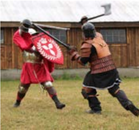
Prince Evander VS Wulfric of Blackwood

Saturday was the adventure day! Rapier, and Heavy combat occurred in their respective fighting rings.