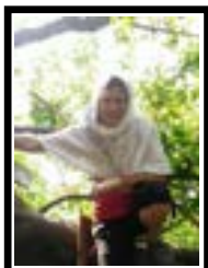
Archery Wencendleof Rokesburg