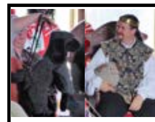
Sheep of Ramshaven "Zippora and Winston"