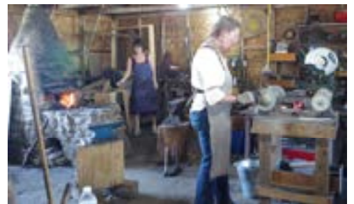
Forging and doll making also took place at this event