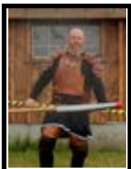
Armoured Combat Wulfric of The Blackwood