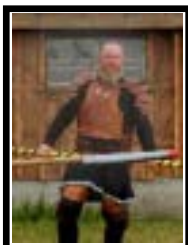
Armoured Combat Wulfric of The Blackwood