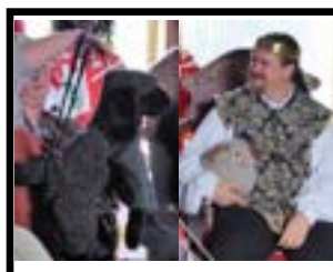
Sheep of Ramshaven "Zippora and Winston"