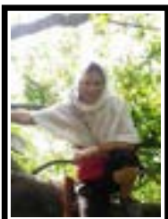
Archery Wencendleof Rokesburg