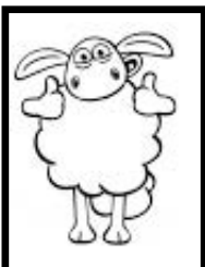
Arts and Science who will it be?