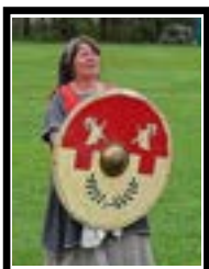
Armoured Combat Sibylla of Glyndmere