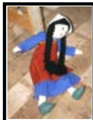
Arts and Science who will it be?