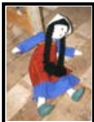
Arts and Science who will it be?