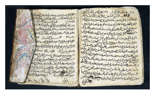
Two pages from the ms of Kitab al-tabikh in the National Library of Finland http://www.doria.fi/handle/10024/31593

Take 1/2 pound stalled pistachios and put them in hot water to remove their thin skins. Toast the pistachios to dry them but do not let them change in colour. Finley grind them. Pound 1 pound refined sugar into fine powder. Punt it in a bowl and sprinkle it with a little rose water and camphor. Fold into it the pounded pistachio and mix until ingredient combine. Shape the mixture into discs or make them look like dates cucumbers or melons. You can also use holds.