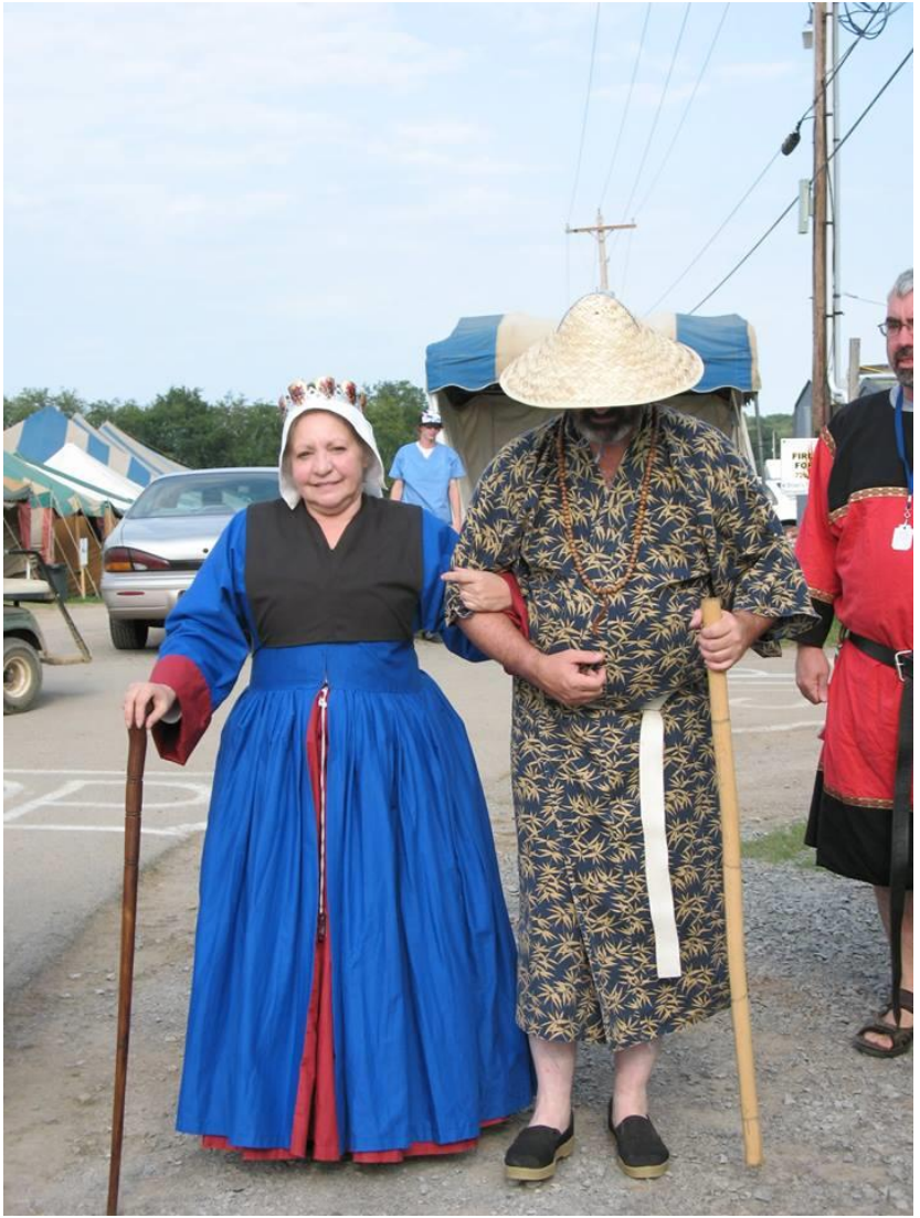
Pennsic 38, 2009