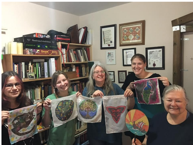
All Silk painting photos taken by Trudi Crump-Wright