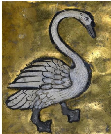
swan bestiary, Flanders ca. 1270 LA, J. Paul Getty Museum, MS. Ludwig XV 3, fol. 41r

From Points East/South of St. Catharine's Take your best route to Queen Elizabeth Way (QEW) heading West to St. Catharine's Take Exit 49 (406, Pt. Colborn, 3rd St., Service Rd.) stay to the right for Third Street Turn Left at Stop Sign (base of exit), go South on Third St. Turn Left onto St. Paul St., W. Regional Road 81 Turn Right onto First Street Louth Site on the Left side of the road before Rykert St. Unloading Zone at West Entrance, Parking in North Lot