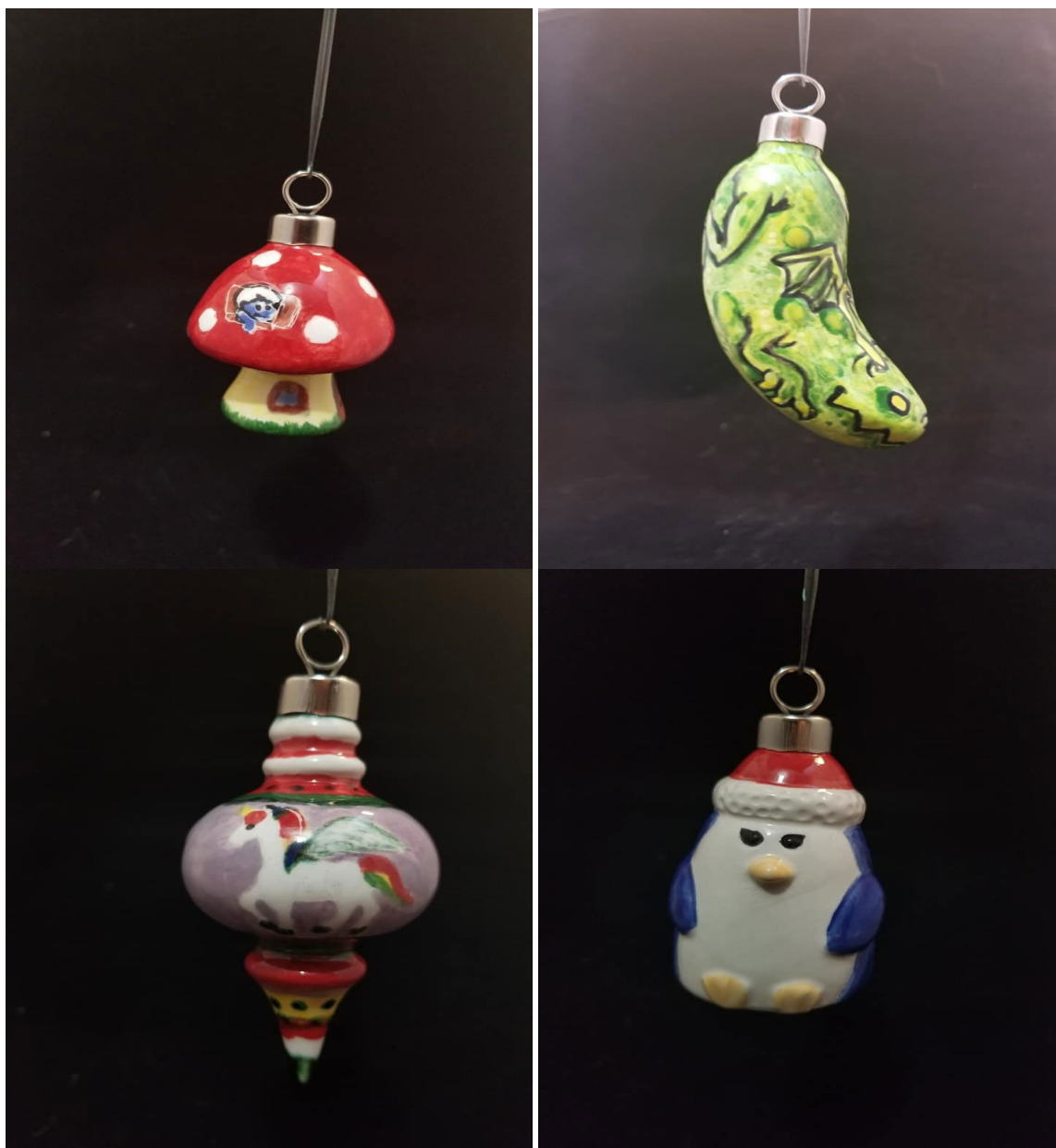
Selection of Ornaments made by Baronial Members