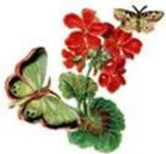
Artwork by Lady Gema Krasil'NiKova