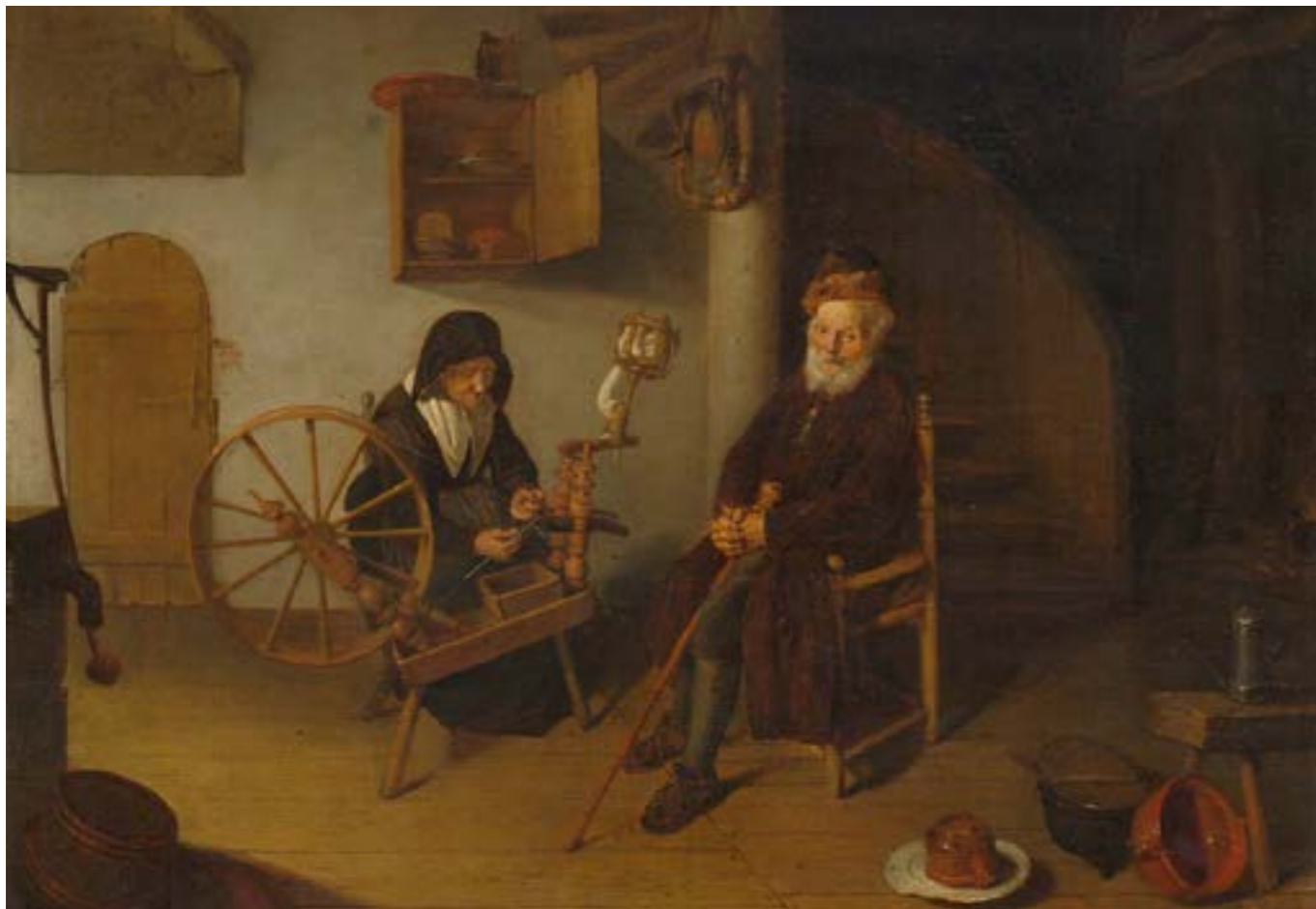
The Spinner, Quirijn van Brekelenkam 1653

Some people expect oaths and ceremonies, some don't. I prefer oath-taking, as this is reminiscent of the medieval apprenticeship process. For me, the ceremony usually involves oath-taking and gift-giving, witnessed by others.