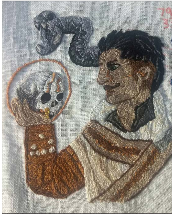
Embroidery by Gelleia le Vintner

I do not have a specific case to cite as a reference for this post but have noticed stitches in images cropping up in different places and used creatively. Whether a stitch was introduced through trade routes, or through formal embroidery dictionaries in more recent times, the same stitches reoccur repeatedly.