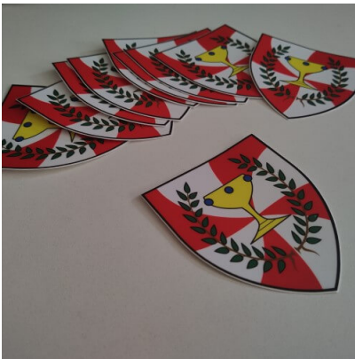
Barony of Rising Waters Heraldry in the form of a 3 inch sticker

As you know, due to inflation, the cost for shipping was bumped up to $15. During our last update we promised that we'd be bringing some fun stickers to the shop soon and did we deliver! Check out our new awesome merch and snag yourself some Rising Waters stickers as well as our Rainbow Pride Devices to show your support! There are discounts for purchasing in groups of 2!