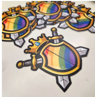
Shnazzy rainbow Heraldry stickers!

Both can be purchased HERE in our shop! Along with many fine articles of garb. Get ready for the cooler season with some new clothes!