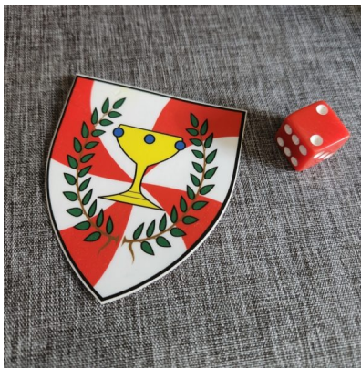
Barony of Rising Waters Heraldry in the form of a 3 inch sticker – dice for scale