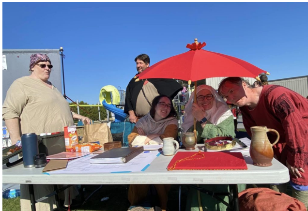
The List Table