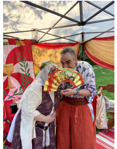
September 6 - Rising Waters attending Step Spritely