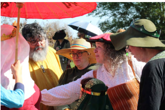
October 4, 2025 Oaths given - including RW laurels