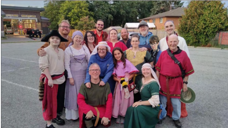
September 13 - Goldfyne Busy Bee Companie Household attends the Baronial Investiture

Their Majesties announced the successors to Baroness Sciath (Calling Crows) - it's Okimâw Mihko & Umesaya Soukurou-rokui