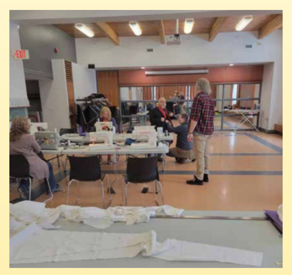
A Ben Dunfirth sewing day in 2023

I would love to see more of these kinds of events held, particularly in the winter months, as a way for people to be involved in A&S at a more local level in the same way the mega-practices have allowed for bigger gatherings for those practicing martial skills. If anyone is interested in putting this kind of thing together and would like to discuss further, feel free to contact me.